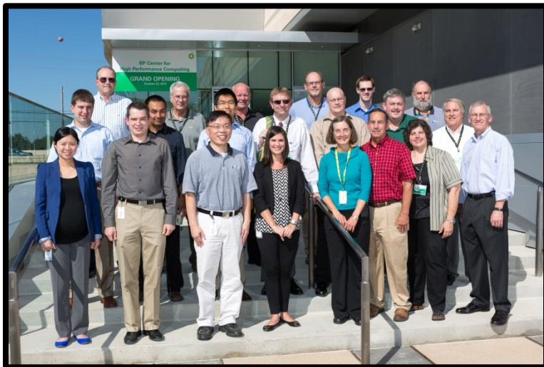
Upstream information technology and services