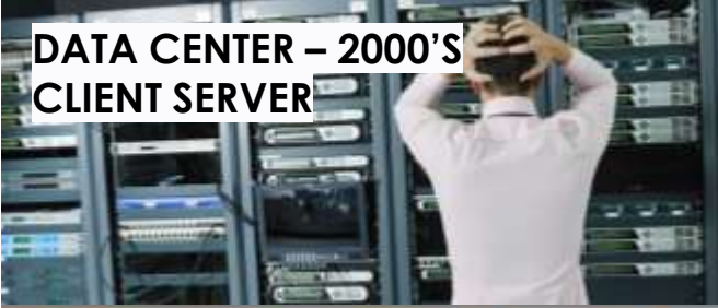
DATA CENTER – 2000'S CLIENT SERVER