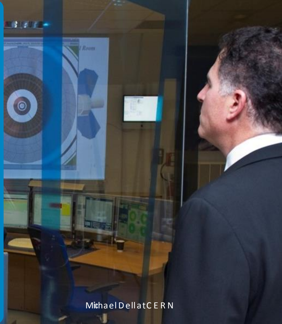
Michael Dell at CERN

Dell will achieve this global impact by building expertise to design, develop, deploy, and support the most capable, cost-effective portfolio of HPC solutions that integrate Dell innovations with community standards.